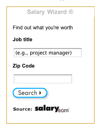
Chart data by